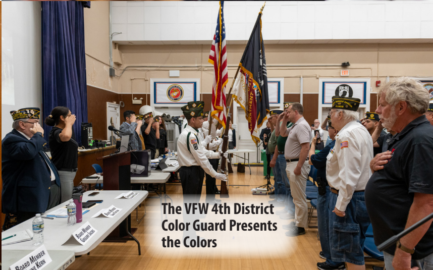
The VFW 4th District Color Guard Presents the Colors